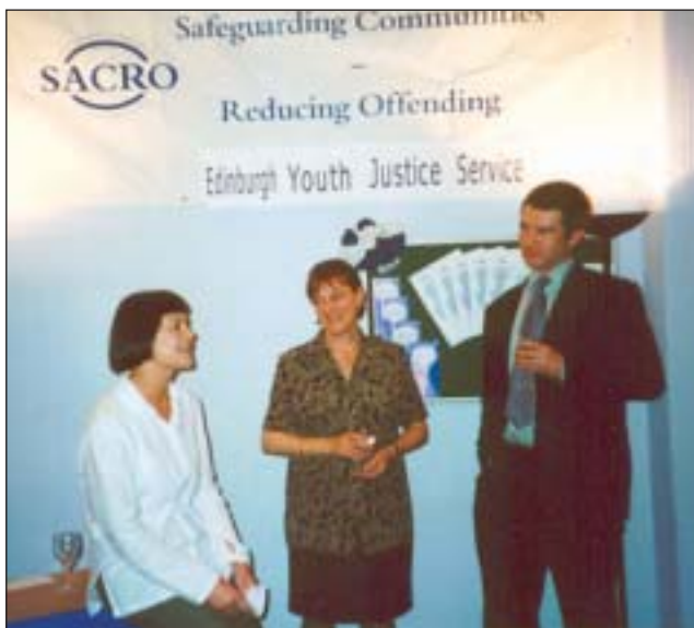
Launch of SACRO Youth Justice Service, Edinburgh, on 15 August 2001

✳ 331 clients were placed in SACRO Supported Accommodation