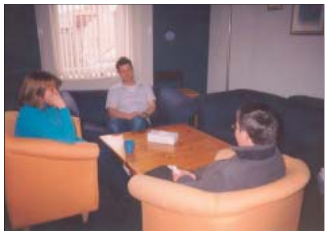
Community Mediation in Aberdeen